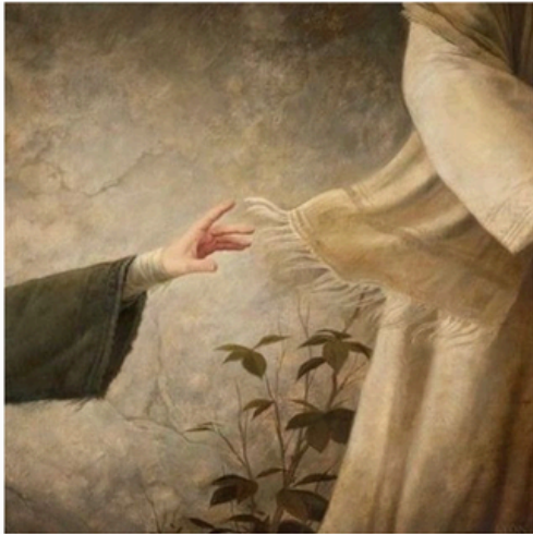
A THREAD OF FAITH. HOWARD LYON