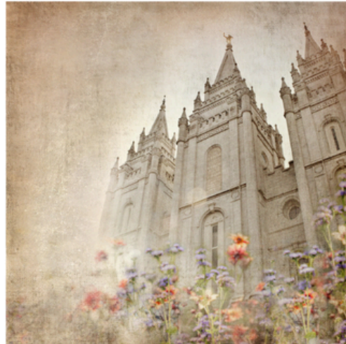
SALT LAKE "TRUTH"