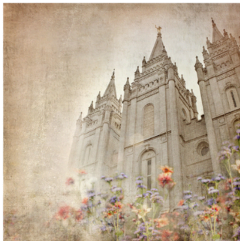
SALT LAKE "TRUTH"

“A PERSPECTIVE THAT IS TIMELESS AND ETERNAL” NEIL L. ANDERSEN