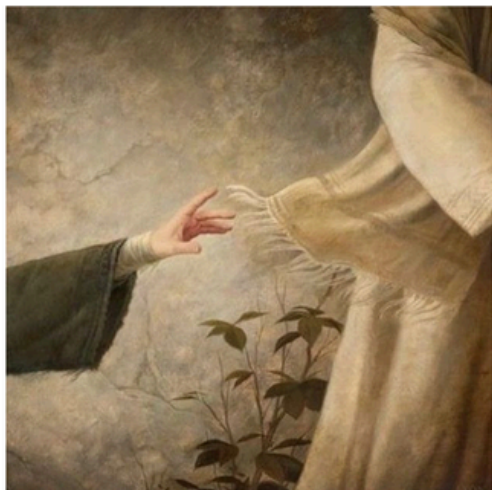
A THREAD OF FAITH. HOWARD LYON