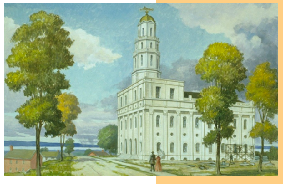
Church Media Library Red Brick Store and Nauvoo Temple