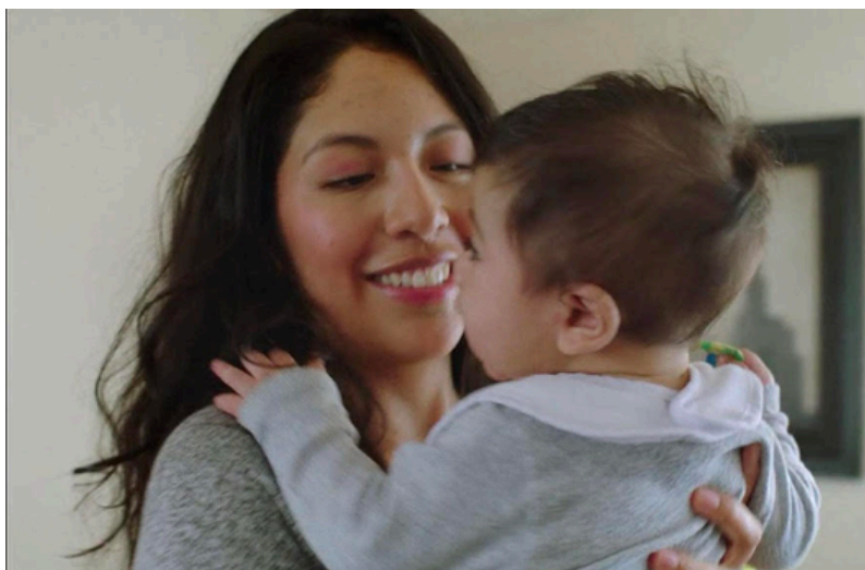
Click on the picture to watch the video