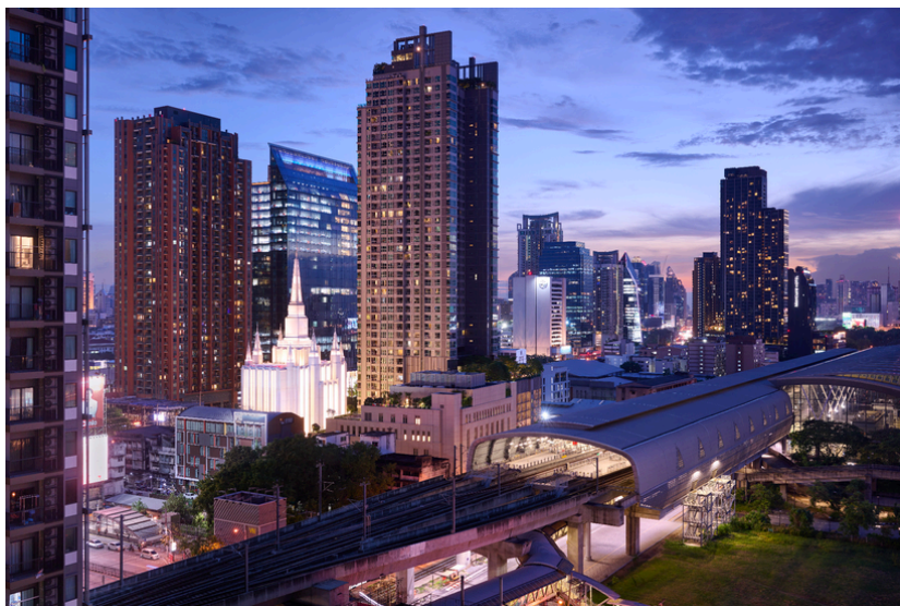
Bangkok Thailand Temple LDS Photograph Gallery

As we encounter challenges that slow our spiritual progress, let us remember the promise given at General Conference from our prophet, President Russell M. Nelson, he said, “ Here is my promise. Nothing will help you more to hold fast to the iron rod than worshipping in the temple as regularly as your circumstances permit. Nothing will protect you more as you encounter the world’s mists of darkness. Nothing will bolster your testimony of the Lord Jesus and His Atonement or help you understand God’s magnificent plan more. Nothing will soothe your spirit more during times of pain. Nothing will open the heavens more. Nothing! ”