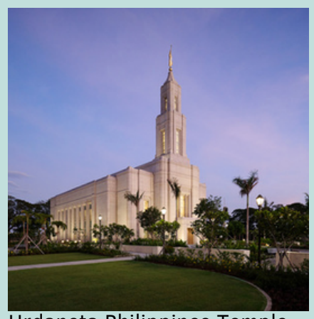
Urdaneta Philippines Temple

=https://www.youtube.com/w atch?v=xXwaSnkKl2k